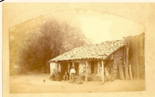
In the Mission Grove